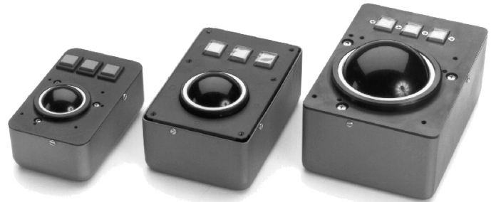
Panel Mount Trackballs with Switches