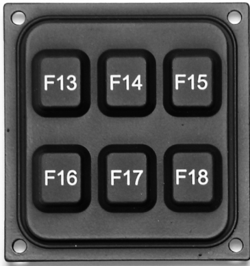
• Pictured with F13 – F18 Legend, F19-F24 Legend also Available

This design ensures years of reliable service and durability across a broad operating temperature range of -40°C to +80°C (-40°F to +176°F). These miniature USB keypads measure 1.8 inches by 1.9 inches and require less than 0.5 inches of below panel depth. Optional backlighting or custom laser etched legends are available to Original Equipment Manufacturers (OEMs).