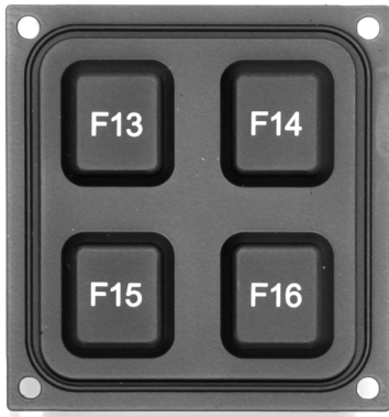
• Pictured with F13 – F16 Legend, F17-F20, F18-24 Legend also Available

This design ensures years of reliable service and durability across a broad operating temperature range of -40°C to +80°C (-40°F to +176°F). These miniature USB keypads measure 1.8 inches by 1.9 inches and require less than 0.5 inches of below panel depth. Optional backlighting or custom laser etched legends are available to Original Equipment Manufacturers (OEMs).