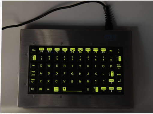
• Shown above KI60U4-BG Illuminated Industrial Keyboard