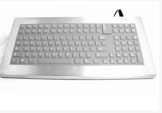
• Shown above KI90U1 Industrial Keyboard