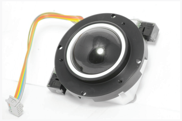
• Shown above T8XXX OEM Aerospace Trackball