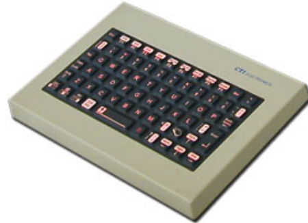
Illuminated Keyboard Model KI60P0-BR shown

When Custom Key Legends are merged with Custom Key Codes, an Industrial Keyboard design can be specified to meet your application exactly.