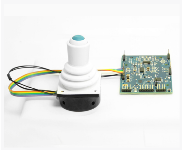
• Shown above F10U0-N3W Medical Mouse

CTI's confidence in the OEM Cleanroom / Medical Mouse is backed by a One Year Warranty. A thorough analysis of healthcare safety, productivity enhancements, and financial savings solidifies the investment decision. For clinicians and laboratory scientists, the ability to hygienically cleanse the Medical Mouse of infectious particles and pathogens will ensure a healthier and safer environment.