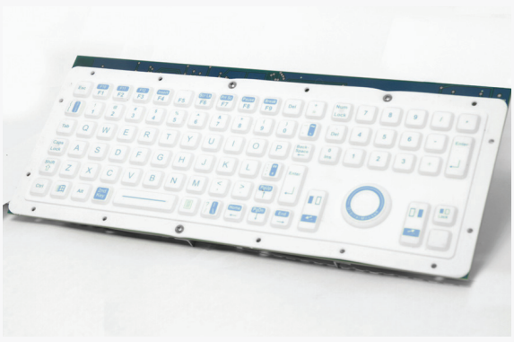
• Shown above KIO78U6 Medical Keyboard with Orbital Mouse®