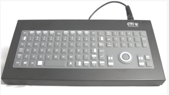
• Shown above KIO74U2 Industrial Keyboard with Orbital Mouse®