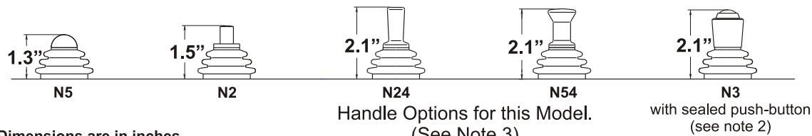
Handle Options for this Model. (See Note 3)

Operating Temperature Range -25°C to 70°C Standard -40°C to 80°C Optional